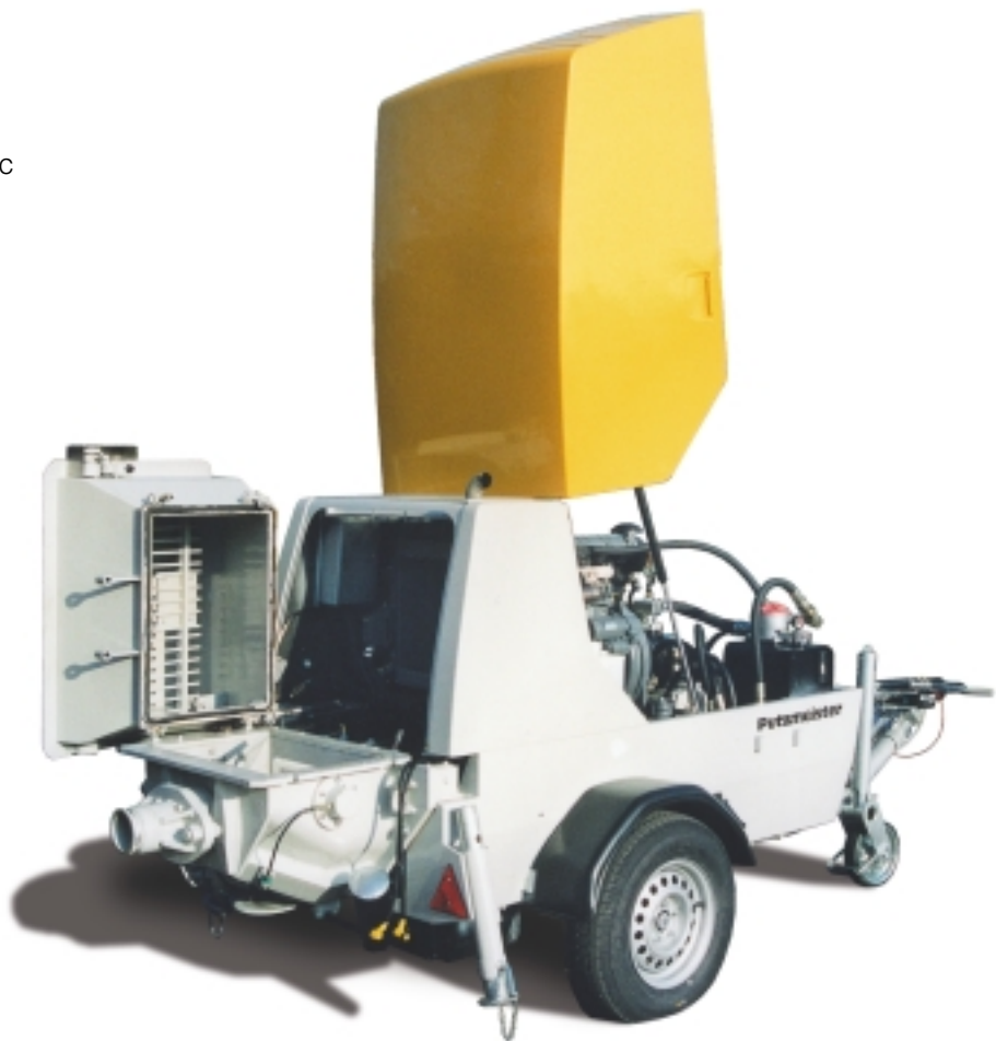
The plastic bonnet that opens widely and the foldable hopper allow easy access to all parts, and make service and maintenance simple

Piston pump as roadworthy trailer with TÜV permit, medium-cooled Diesel engine, connection 4.5" SK, clamp couplings with seal, standard accessories and tools, operating instructions and spare parts list