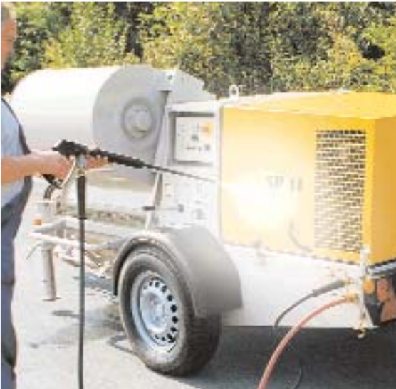
You can quickly spray your SP 11 with over 140 bar pressure with the built-in high pressure cleaner (DMR).