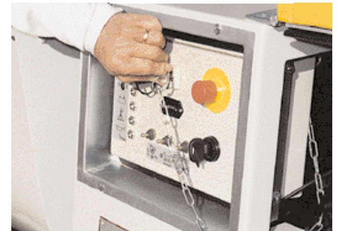
You can control your SP 11 with the clearly-arranged, lockable control cabinet.