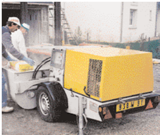
... or the SP 11 DMR with the hydraulic lift mixer – pure comfort.