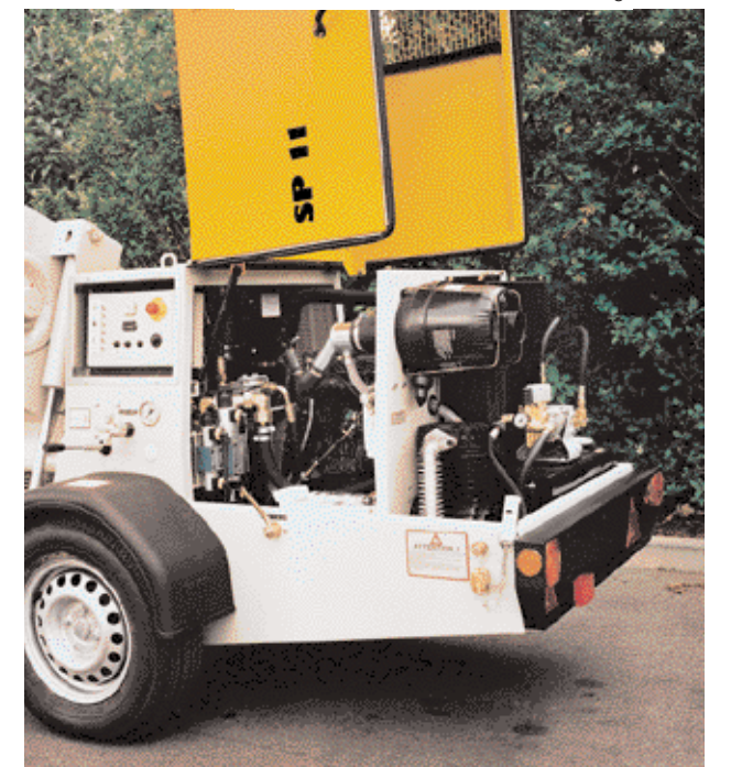
The light-weight cover can be opened extremely widely. It is therefore very easy for you to reach all the inside parts.