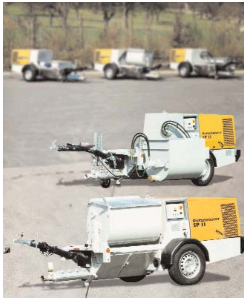
The "SP 11 family": SP 11 DMB with swing mixer (in front), SP 11 DMR or SP 11 DQR with lift mixer (behind) and the SP 11 DHF for floorscreed (upper left)