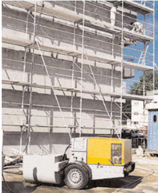
The powerful pumps always have sufficient power reserve even over great distances.