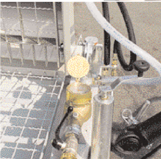
You can set the amount of water needed infinitely variably at the water metering fittings.