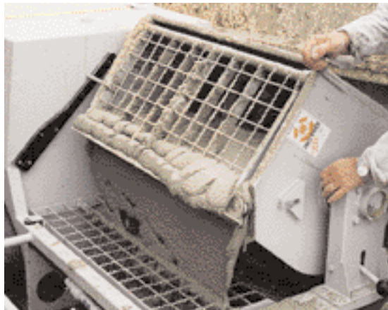
It can be so easy. The SP 11 DMB with the comfortable swing mixer ...